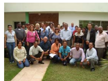
Cabaré visits CENTA during the project's launch meeting in the Dominican Republic, March 2011

and IDIAF. Newspapers clippings are available to project's participants upon request. Please contact Olivier Simon ( olivier.simon@cirad.fr )