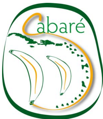
The Cabaré logo represents the Caribbean region and bananas