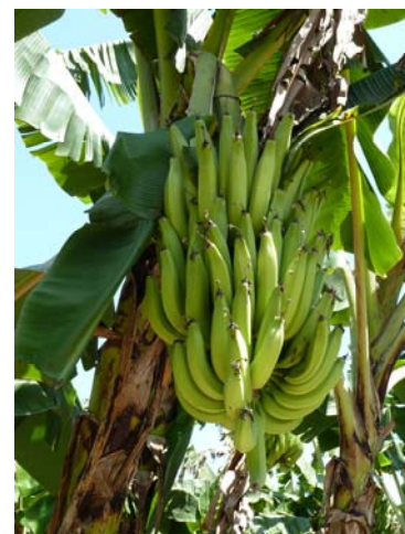
Fruit bunch of a FHIA21 hybrid

A pdf version of the technical report poster is available to project's participants upon request. Please contact O. Simon ( olivier.simon@cirad.fr )